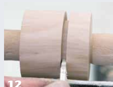
12 Parting tool cut showing some clearance on the left side of the tool after widening the cut.