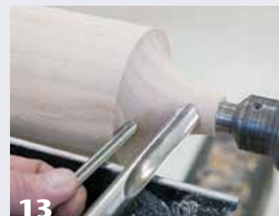
13 With relatively little mass, a ¼" (6mm) spindle gouge (at left) requires support from the toolrest close to the cutting tip. The heavier ½" (13mm) gouge is more stable and can be extended farther beyond the toolrest. Greater tool stability equates to a smoother cut.