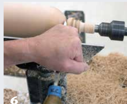
Cutting the right side of a bead with a skew. Note the three components of tool movement during the cut: vertically, upward; horizontally, from left to right; and rotationally, clockwise.