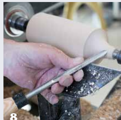
Cutting the left side of a cove illustrates the combination of the cutting arcs. Vertically, the tool handle moves upward; laterally, to the left; and rotationally, counterclockwise, with the flute twisting from 3 o'clock to 12 o'clock.

watching the tool handle while grinding a gouge with the assistance of a sharpening jig.