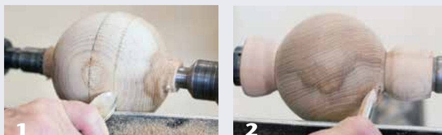
Direction of cut depends on grain orientation. At left, shear-cutting "downhill," from large diameter to small, on a sphere with the grain parallel to lathe bed. At right, shear-scraping "uphill," from small diameter to large, with sphere repositioned and its grain perpendicular to the lathe bed.