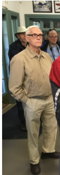
Remington Carriage Museum in Cardston. 2018

https://lethbridgeherald.com/obituaries/2024/01/06/saturday-january-6-2024/