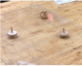
And the winner is ...

Our annual December, pre-Christmas meeting was well attended and enjoyed by those who participated.