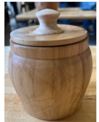
Remie's lidded box.