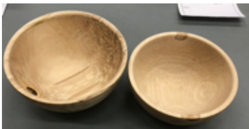
No explanation attached,