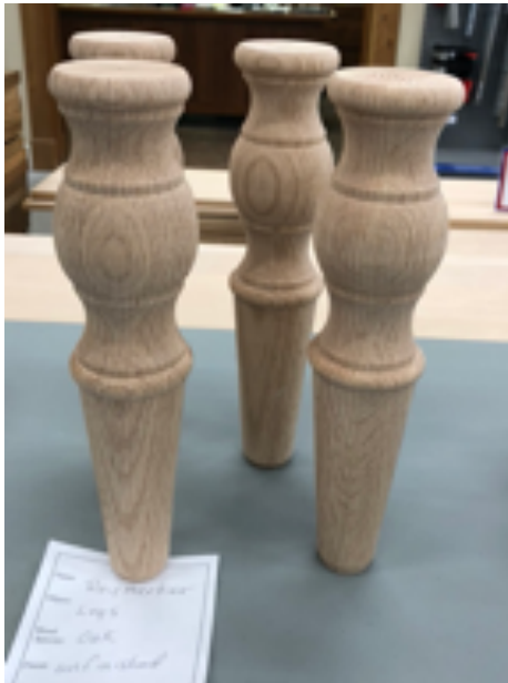
4 Turned legs - oak.