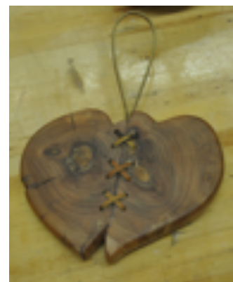
Unknown but very interesting.