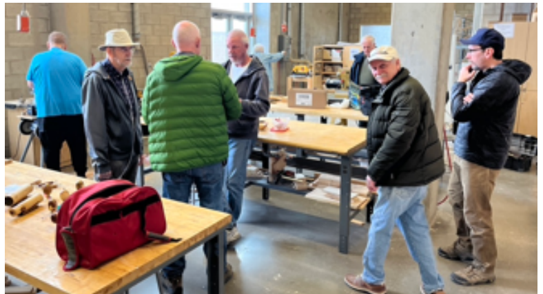
Sawdust sessions are for solving the worlds problems or wondering what the other guys are talking about.