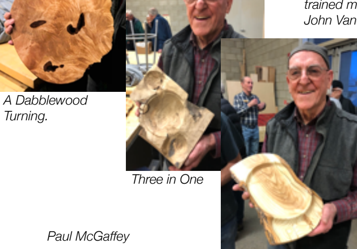
Live Edge Bowl with Wings