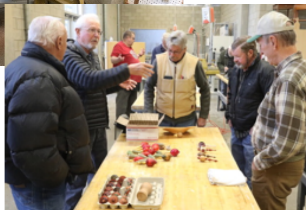
Some good fellowship!