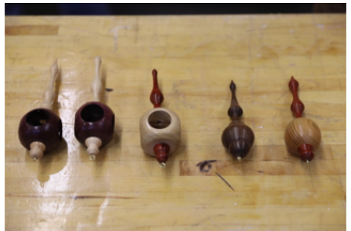
From the Sawdust Session.