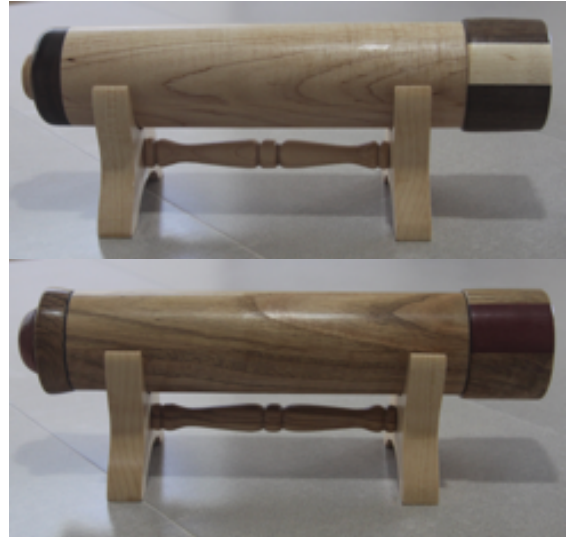
Kaleidoscopes - 12" x 2 1/2" Terry Beaton