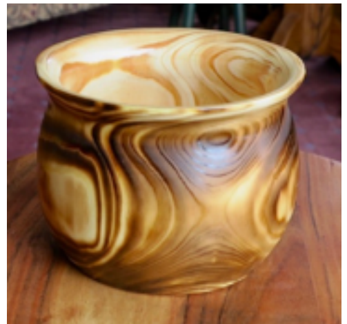
Vase of unknown wood, bowls of Scots Pine, one of them torched to bring out the grain. Kenn Haase