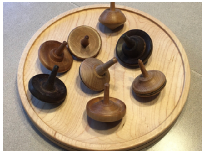
Tops for the annual top sale for the Food Bank Terry Beaton