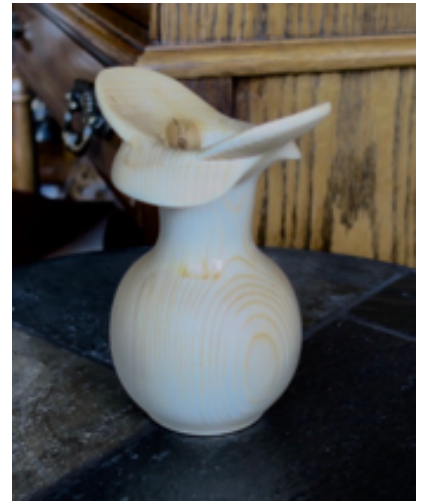
Wiing-Ding - Spruce Ken Hasse