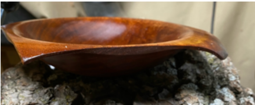
2 3/4"H x 9" - Australian Blackwood - Mahony's walnut oil finish Roger Wayman