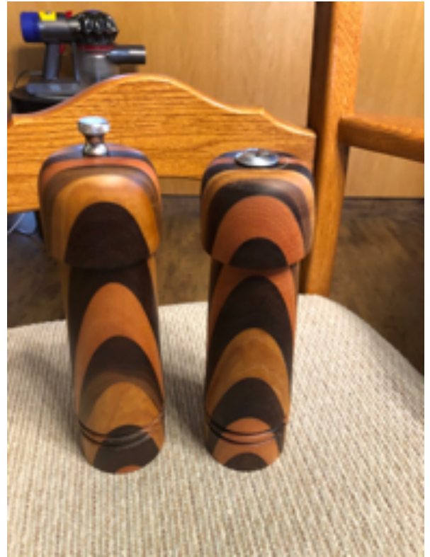
Salt and pepper grinder Norm Stelter