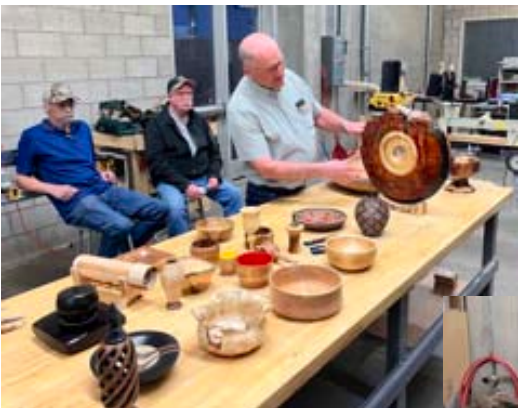
Instant Gallery table.