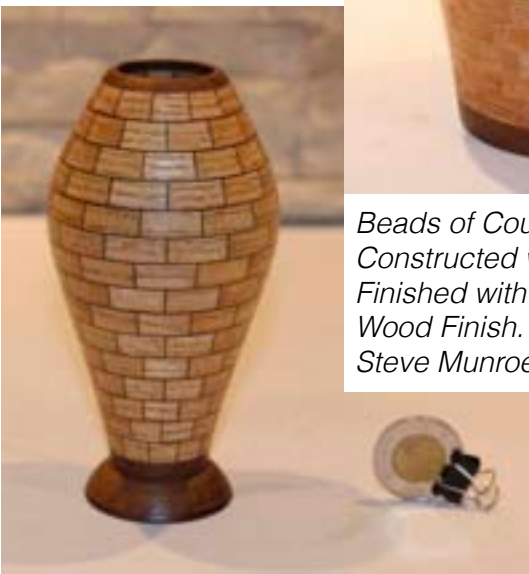
Mini Vase constructed of oak and walnut. Steve Munroe