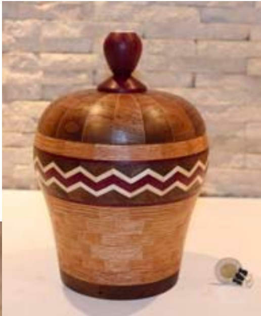
Beads of Courage Program donation. Constructed with various hard woods Finished with Tried & True Original Wood Finish. Steve Munroe