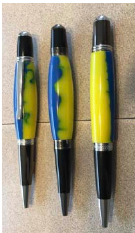
I had a request to make 3 chalk holders in the Harley logo colours (black and orange). I also made pens for the Ukranian Relief Fund. Terry Beaton