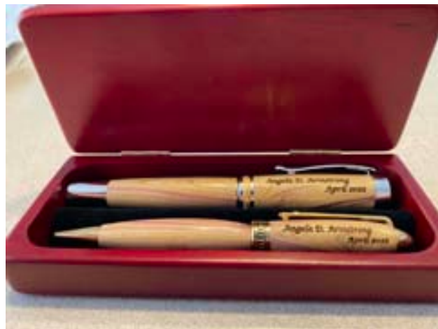
A gift of a European and fountain pen set made with lilac, from Coaldale. Terry Beaton