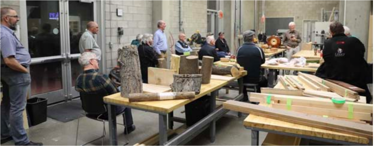
Welcome to the first meeting in two years.