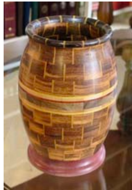
First attempt at 'segmented turning.' Very time consuming, etc., but my wife likes it! Kenn Haase