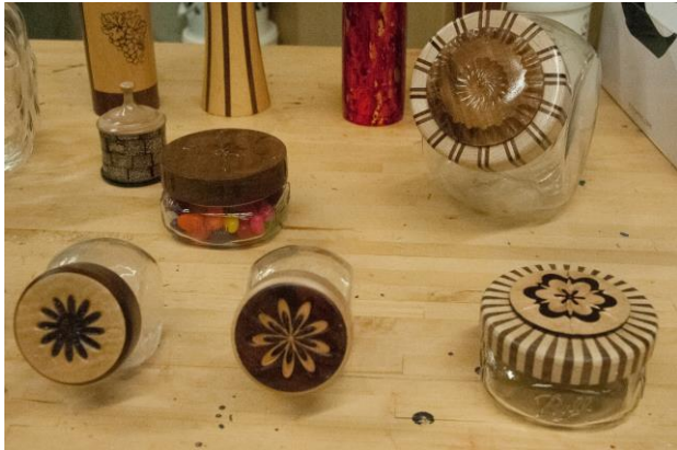
Some of Ross' Rose Engine Work

rocking motion controlled by variously shaped templates.