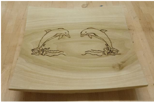
All Three of the above pieces were turned by Norm Stelter