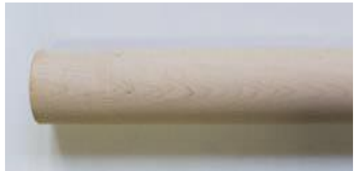
The Bring Back Piece for April – donator uncertain

This program has continued to add interest to each and every meeting that I am able to attend. First of all to see what was brought back and secondly what kind of wood was brought in this time.