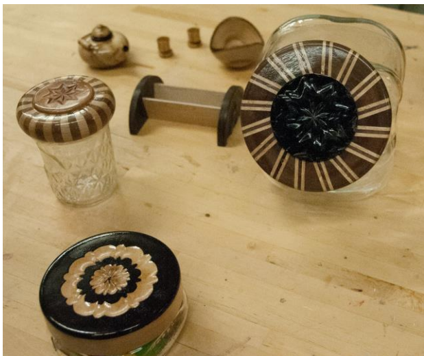
More Rose Engine Work

When the motor of the lathe is on, the wood is rotated and rocked back and forth simultaneously. Then the motor for the cutter is started and the cutter is advanced to contact the wood. Advancing the cutter causes a deeper cut, moving the cutter sideways causes a wider cut. With the combination of the cutter cutting and the lathe rocking and rotating, beautiful patterns can be produced on whatever is being held in the chuck.