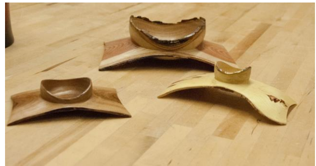
Some winged bowls