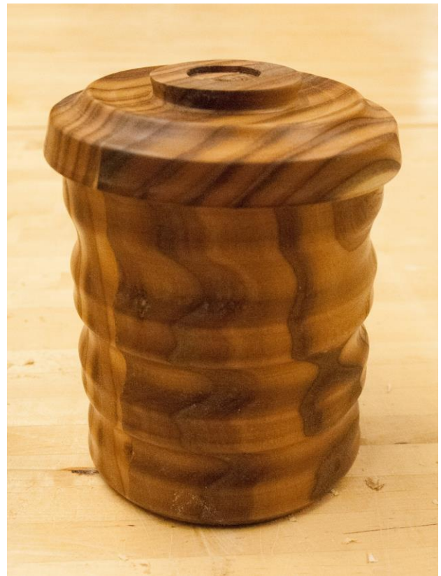
Roy Reti's box