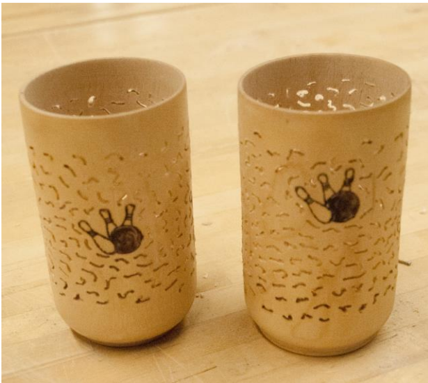
Norm Stleter's Pierced Boxes