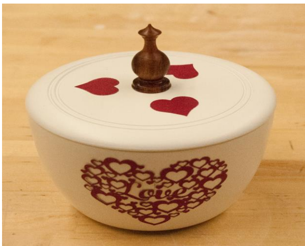
Suzi's Valentines Box – lucky lady!!!!