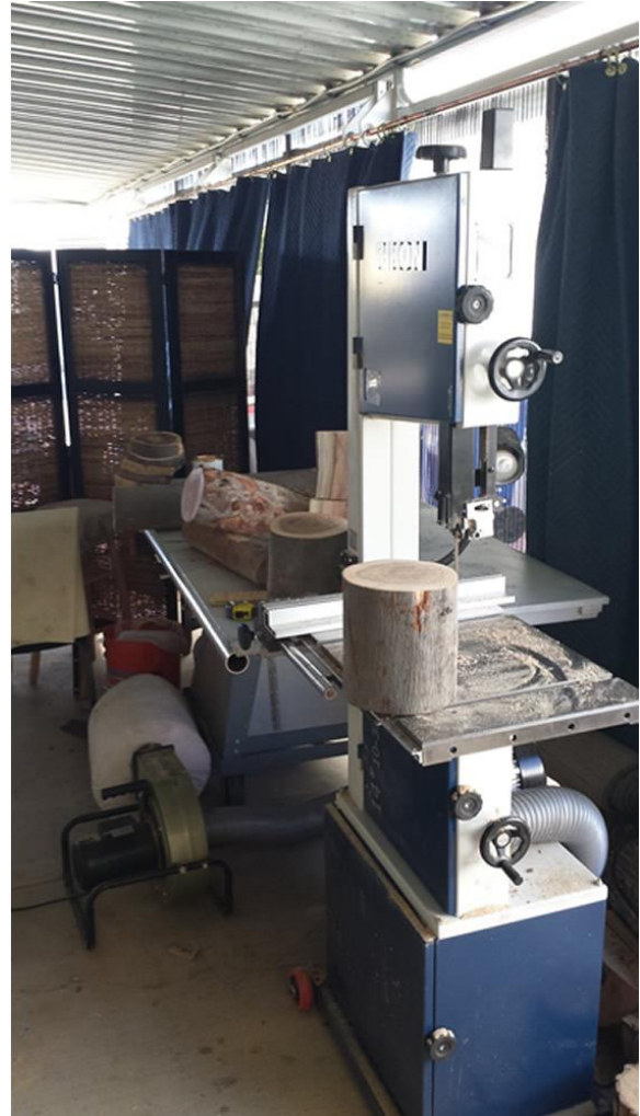
Remi's Shop in Mesa