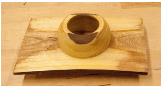
Winged Bowl by unknown source