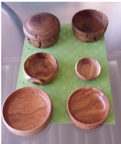
Remi's Bowls From Mesa

In the last picture the top bowls are mesquite and have the worm holes, the second row is Carob, and the last row is "I believe" eucalyptus.