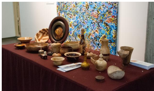
Guild Members Exhibition at Art Days