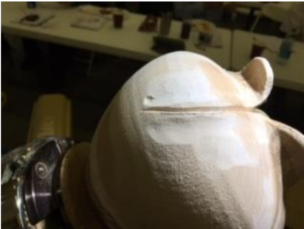
One of Trent's Vessels of Intrigue

The above picture and the ones below are examples of Trent's pieces from the Great Falls Symposium in Sept.