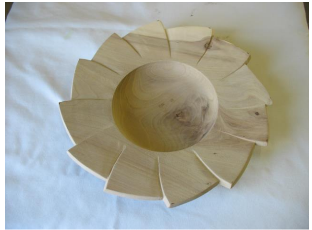
Same bowl from the top