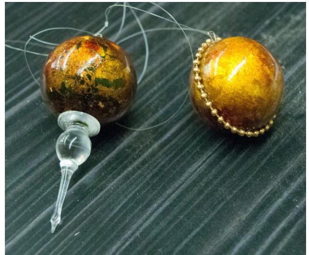
Ornaments by Suzi Tomita