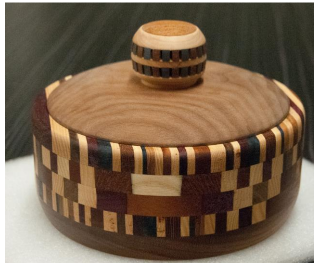
A segmented box by Norm Stelter