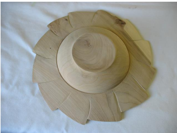
Another bowl from the bottom