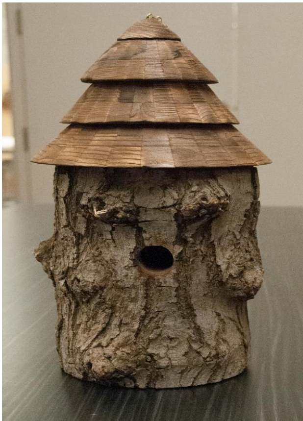
Ross' Bird House