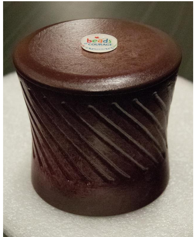
A box by Suzi Tomita