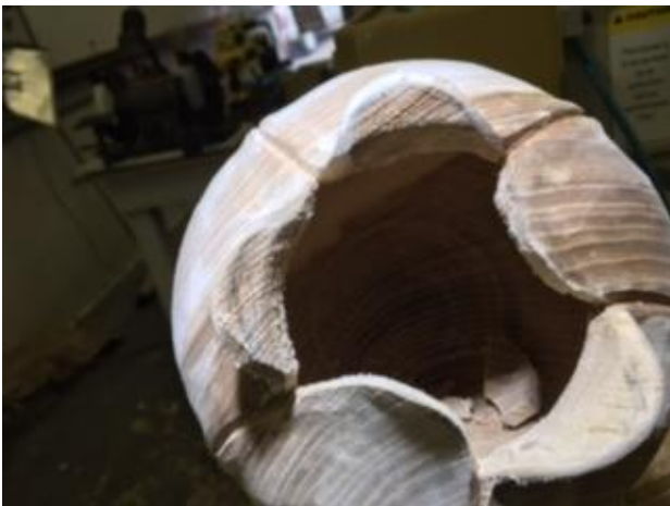
Same piece from the top