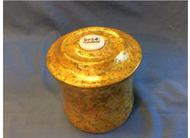
Suzi Tomita's Box