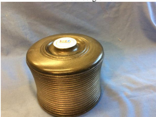
Suzi Tomita's Box