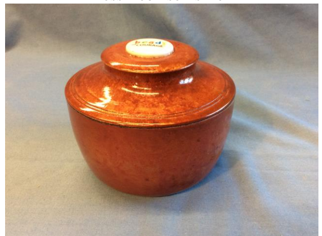
Suzi Tomita's Box