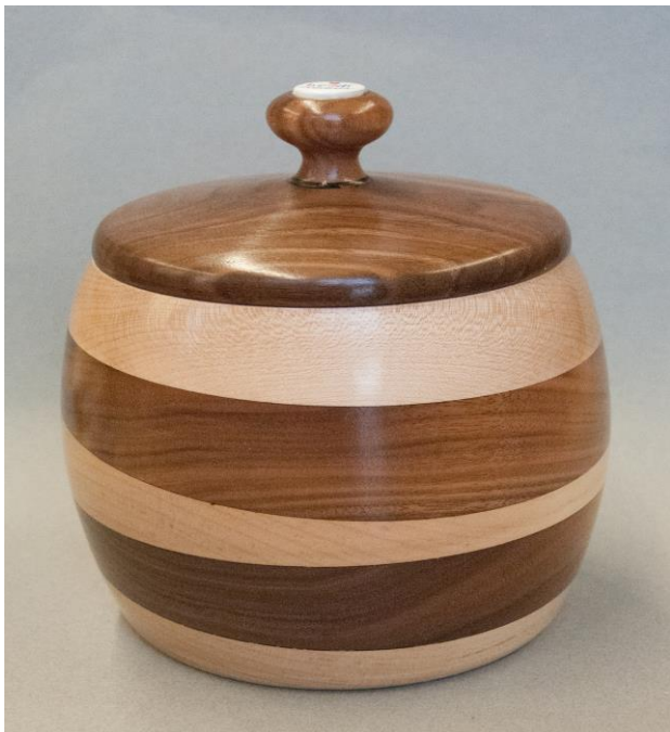
Vern Miller's Box