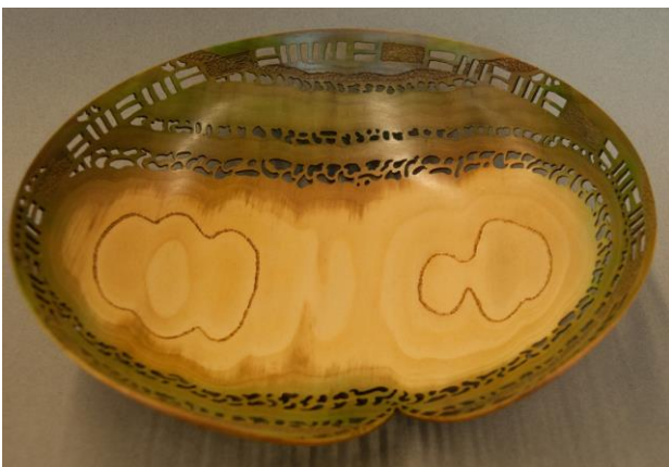
Jim Jones Bowl