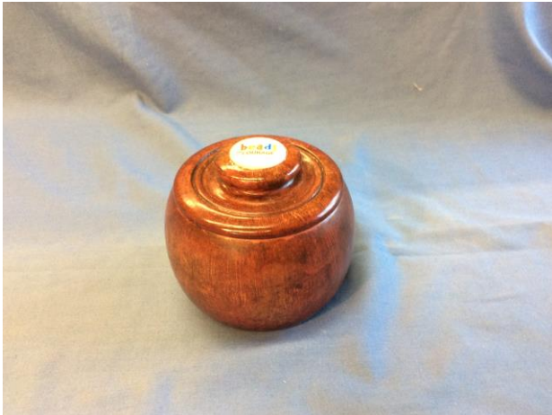
Suzi Tomita's Box