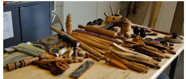
Some of Andrew Glazebrooks Product