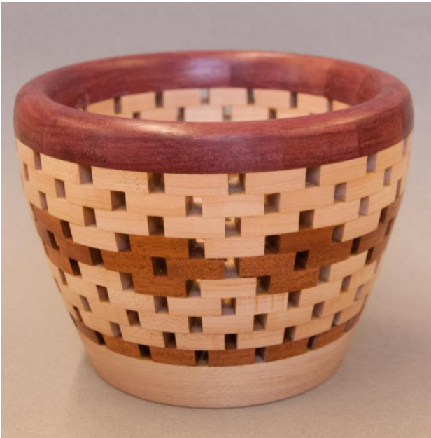
Norm Stelter's Segmented Bowl

If I have forgotten anyone's pictures I apologize. Typing with 7 fingers has been a challenge. See you next month. Jim