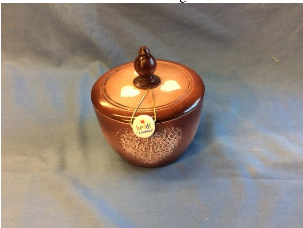
Suzi Tomits's Box