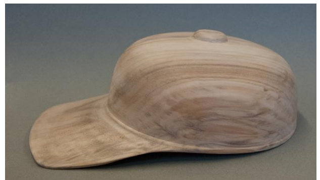
Norm Stelter's Hat