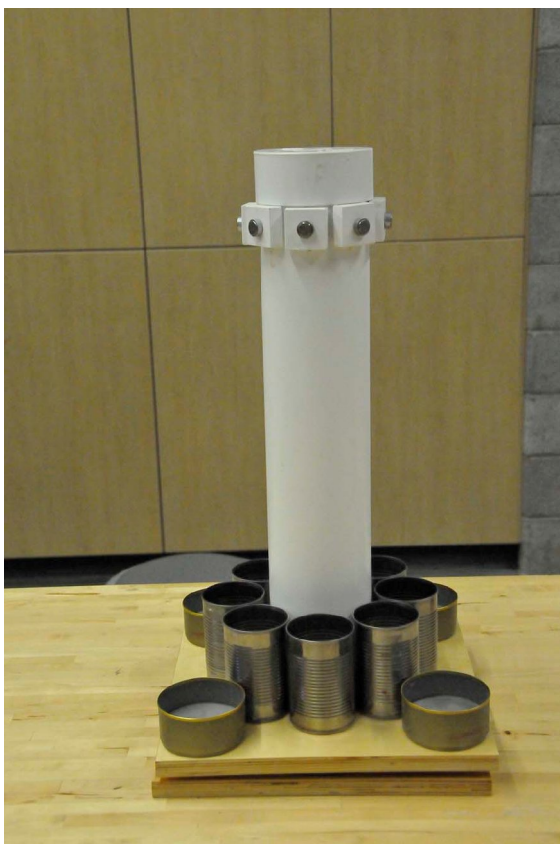
Claire Norton's Gouge Stand

I know that the library was brought out and opened up at the last meeting. I also know that Vern added a couple of new videos to it. I hope that some of you are using it. It is a wonderful resource and I can only hope that it continues to be well used.