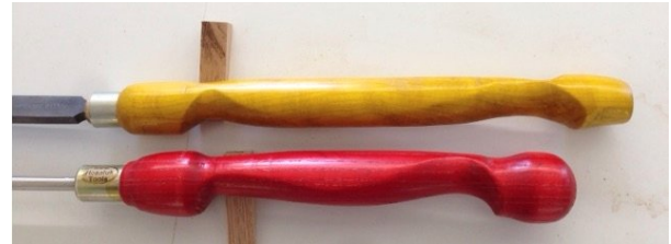
Dan's Off Center Tool Handles