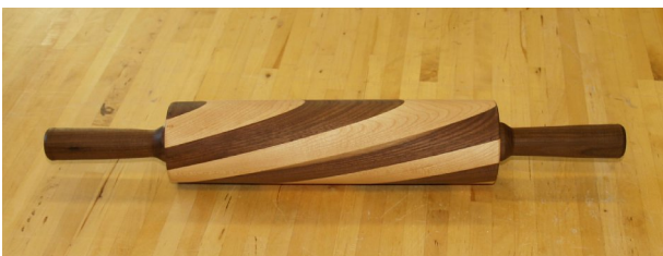
Norm Stelter's Rolling Pin