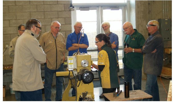
Workshop Day 1 – Listening In