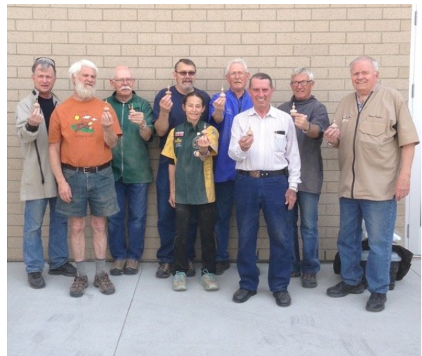
Workshop Day 1