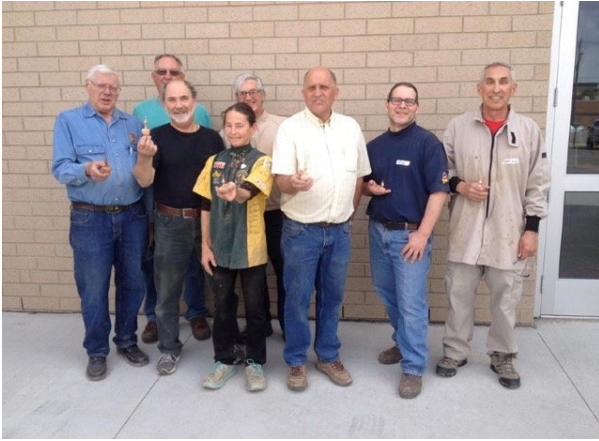
Workshop Day 2

fair time to each one according to their needs. Everybody finished the project! A testament to great mentorship.