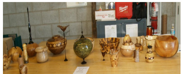
Instant Gallery Pieces – at the Demo