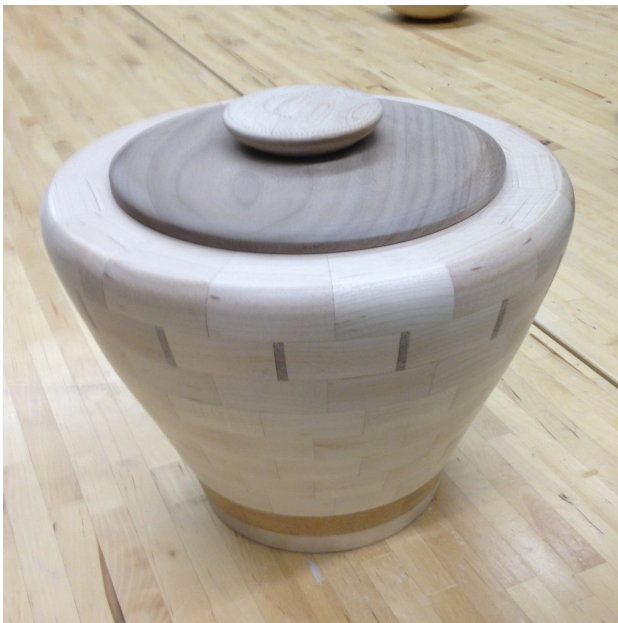
Figure 2 - Norm Stelters Bowl