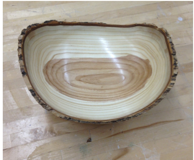
Figure 6 - Dennis' Natural Edge Bowl

If momma won't let you raid her cutlery drawer, you can get 2 or 3 for a dollar at the Dollar Store.