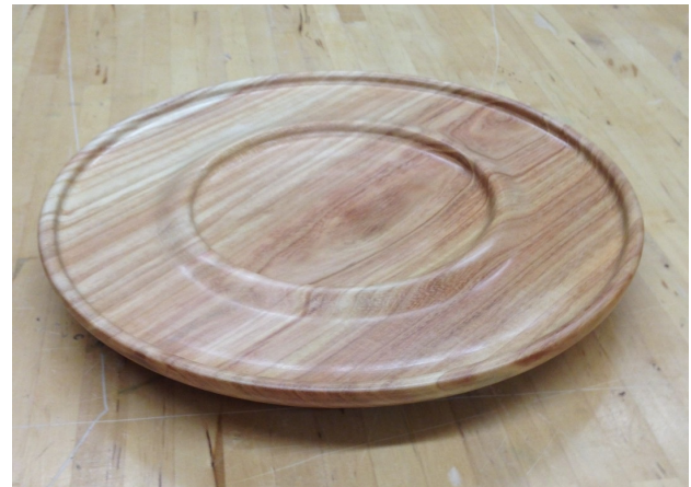
Figure 5 - Roy Reti's Platter