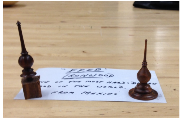
Figure 4 - Suzi's Finials