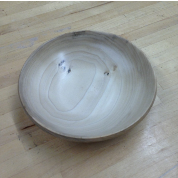
Figure 9 - Roy's Bowl