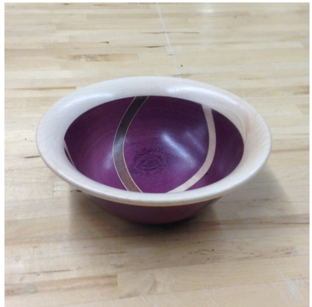
Figure 1 - Jim Farr's Bowl

I know that the library was brought out and opened up at the last meeting. I also know that Vern added a couple of new videos to it. I hope that some of you are using it. It is a wonderful resource and I can only hope that it continues to be well used.