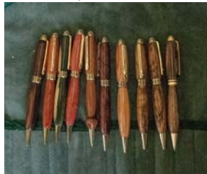
Some of Terry's pens