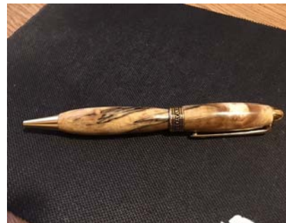
Terry's pen from the demo

This was followed up by a sawdust session with Terry on pen making