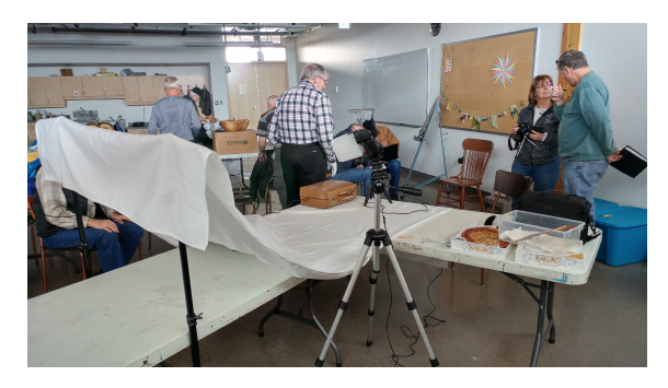
Ed then worked with individual members, taking photos of their work and discussing various aspects of getting a good photo.

Ed set up a fairly simple setup, consisting of a camera on a tripod, 2 flash units and a drape cloth background