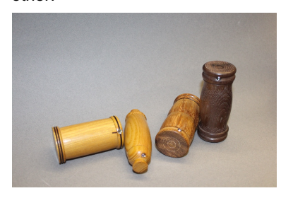
Using 2 forstner bits, 1/4" different in sizes. He first hollowed the inner part of the box then parted it off.

A purse box consists of 2 tubes, one of which slides inside the other.