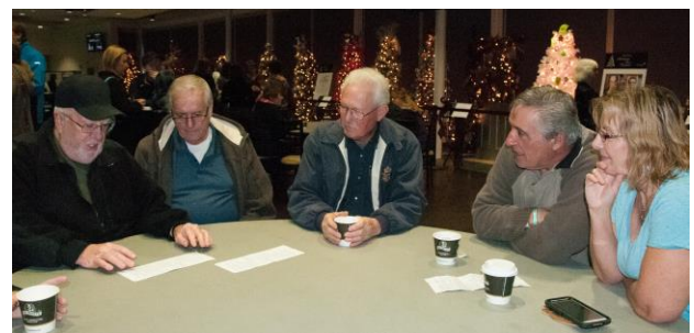
Woodturners Sharing Lies and/or Techniques