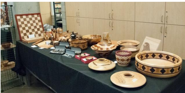
Norm Stelter's Table at CASA