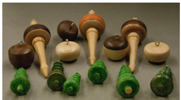
Norm Stelter's Ornaments – Sorry Norm!!