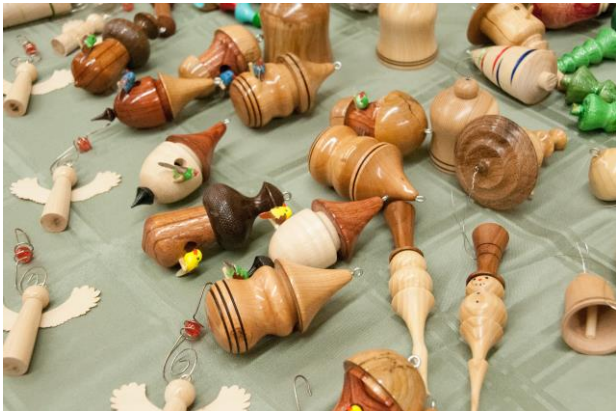
Some of the Ornaments for the tree