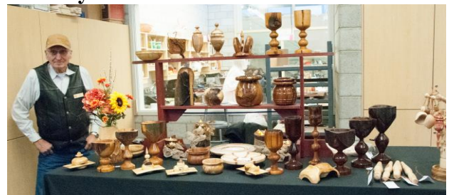
Roy Reti's Table at CASA