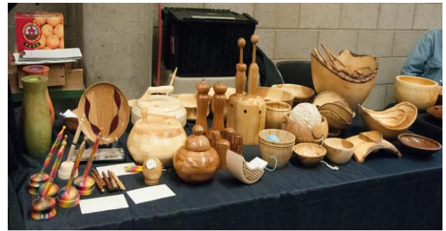
More of Dennis' stuff at CASA