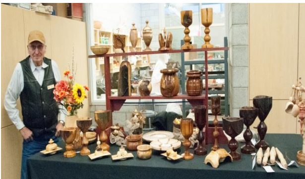
Roy Reti's table at CASA