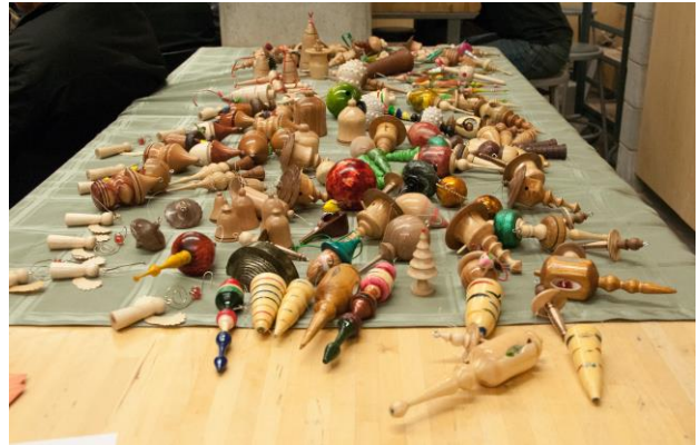
More and More