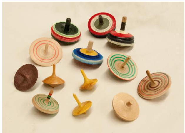
Tops for the Food Bank