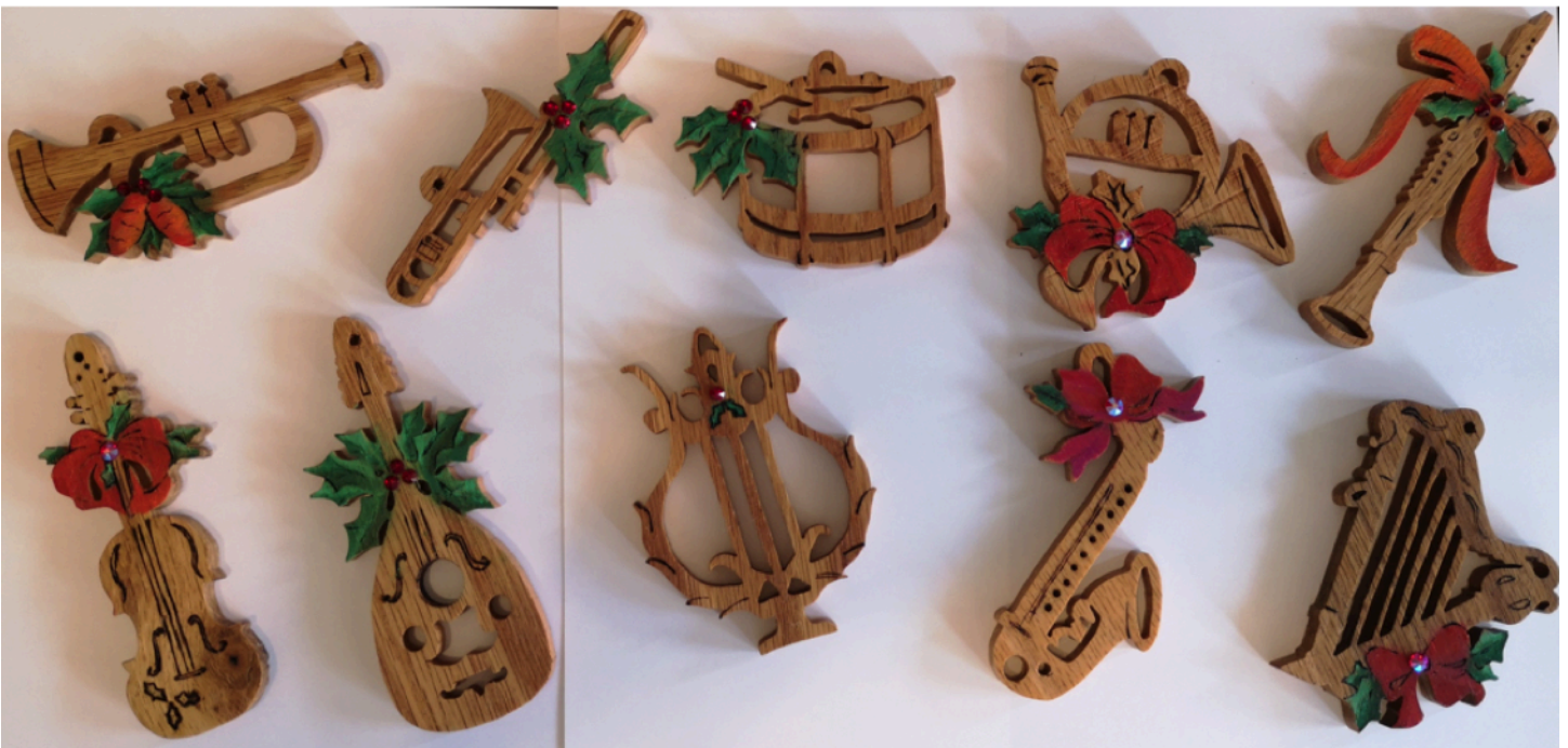
Lorraine Mix is our undisputed master of scroll saw work.