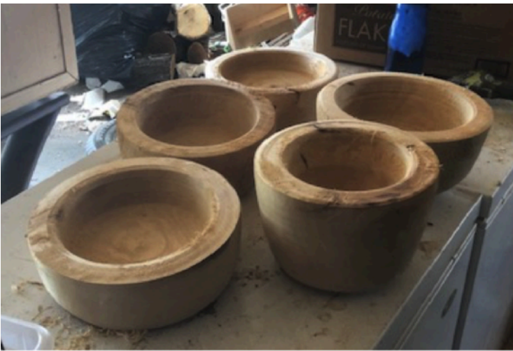
Five birch chunks. A lot of figure and some spalting. Rob Thomsen