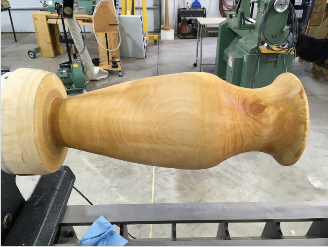
Birch vase almost finished. 17" deep x 7" wide. Dan Michener