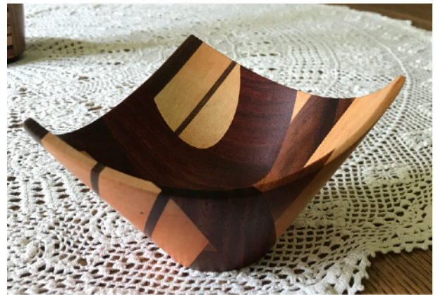
Three corner bowl. Roy Harker