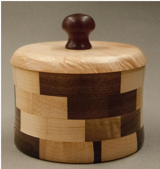
Terry Beaton's – Segmented Box