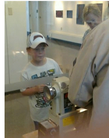
A future turner maybe