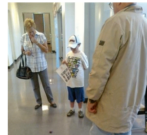
Yes, the top works