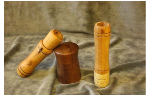
Norm Stelter - Bird calls