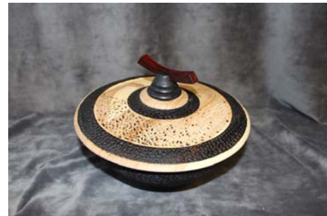
Roger McMullin - covered bowl