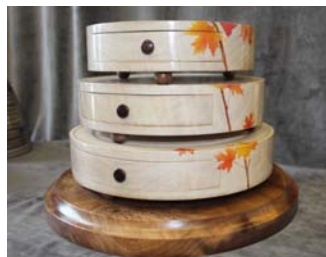
finished set of three