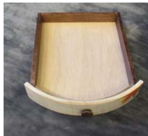
A completed drawer

Kai has an interactive website ( http://www.kaimuenzer.com/boxes-and-jewelry-cabinets/drawer-calculations-for-turners ) which helps the woodturner to calculate the drawer dimensions based on cabinet diameter and wall thickness, allowing the artisan to maximize the area for the drawer within the cabinet cylinder. Careful measurement throughout this project will be rewarded with a drawer which actually fits and runs smoothly.