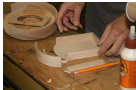
Fitting and adjusting the drawer