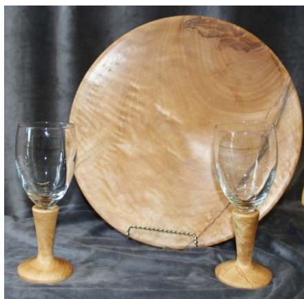
Norm Stelter_Birch Platter &amp; Goblets