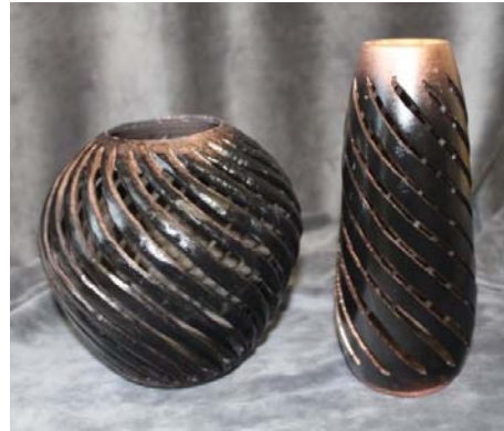
Dan Michener_Birch hollow forms