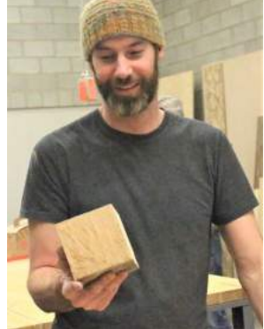
to Jerome Veenendaal