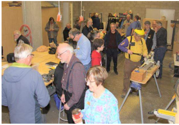
Christmas camaraderie & lots of discussion