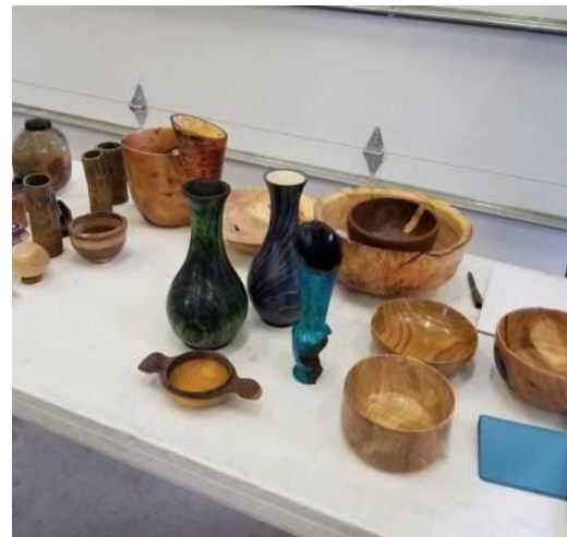
Part of Great Falls instant gallery

I certainly felt it was a worthwhile experience and would certainly consider participating again in the future.