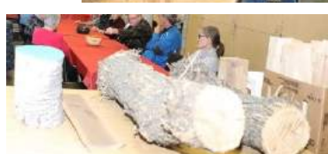
Wood for the raffle