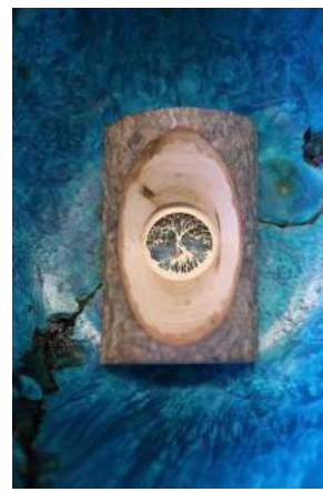
Norm's tree in Dan's bowl