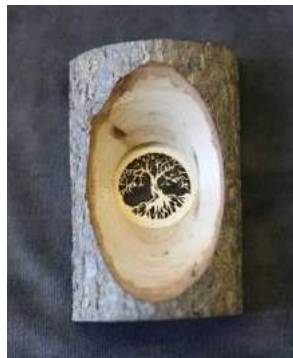
Norm Robinson_lazer cut tree