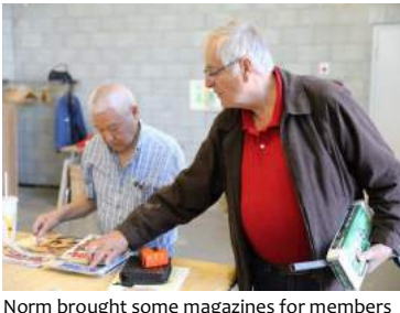
Norm brought some magazines for members

The consensus was that it was another worthwhile morning for woodturners.