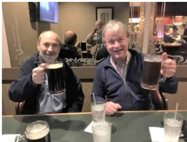
It wasn't all hard work