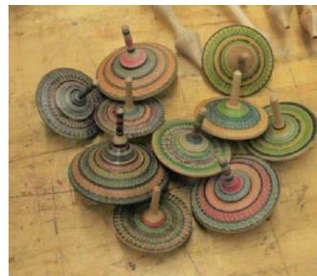
Spinning Tops for Food bank sales