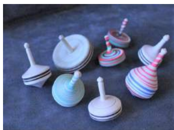
Norm Stelter_tops for the Food Bank