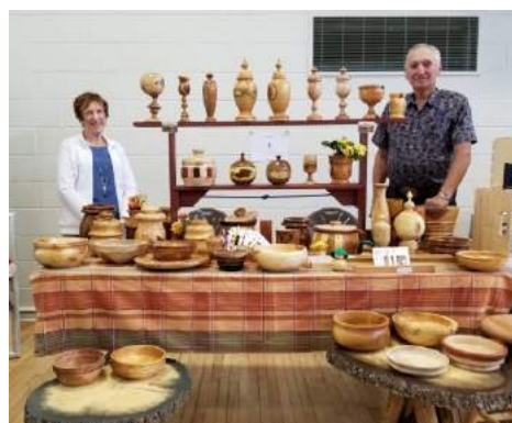
The Retis at Waterton