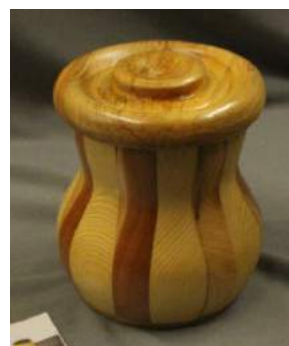
Oct 2019 Roy Reti