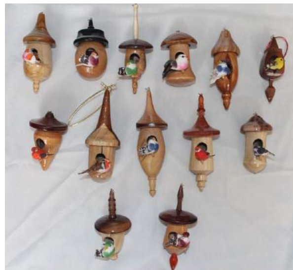
Gunter Schulz Bird houses with birds