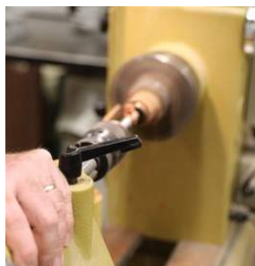
Once the barrel is formed, the centre of the house is hollowed out using a Forstner drill bit.