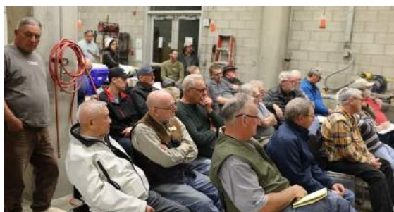
members paying close attention