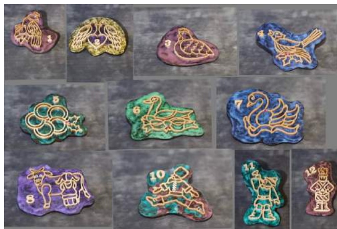
Lorraine Mix_12 Days of Christmas