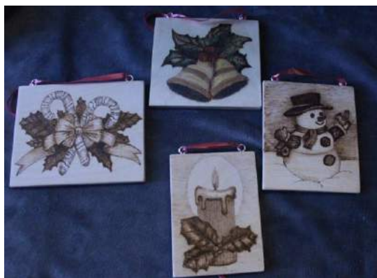
Dennis Hooge 4 plaques