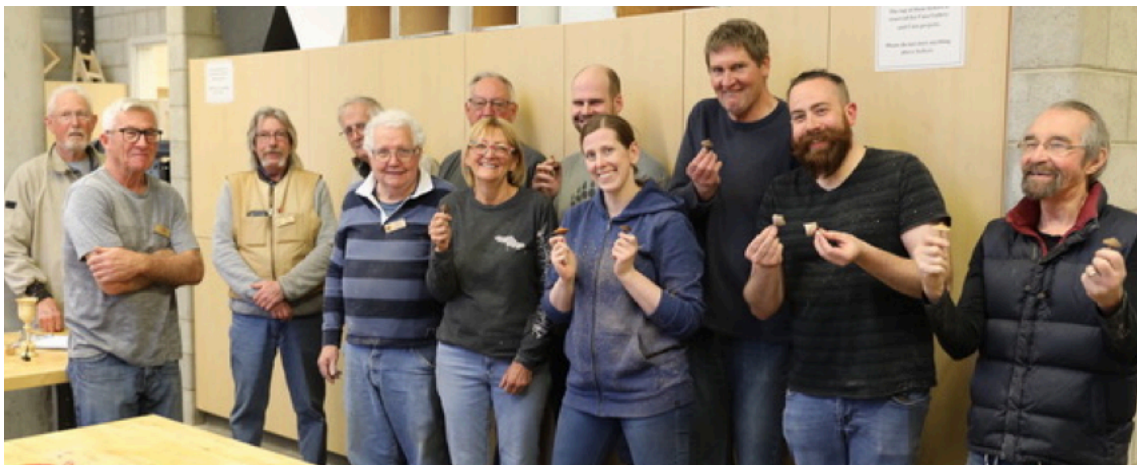
Proud parents of newborn tops.