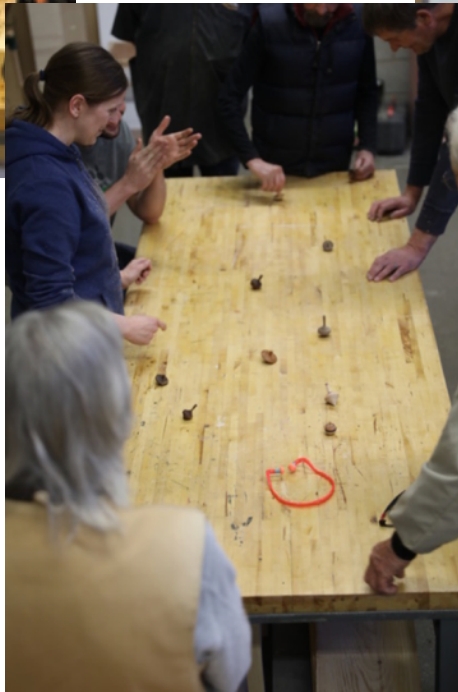
The spin-off. Only one still standing.