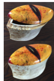
Wilf Talbot Calgary Woodturners Guild