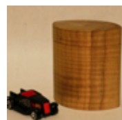
Norm Olsen Calgary Woodturners Guild