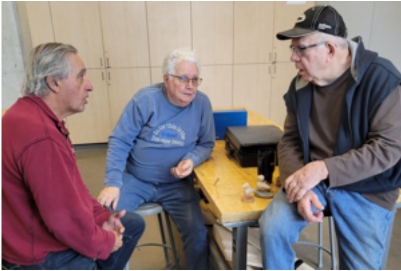
This is what Sawdust Sessions are for - solving the deep problems.