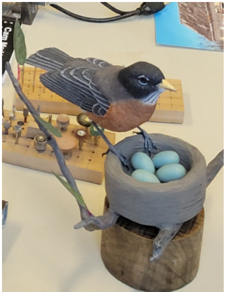
An example of Ray's bird carving.