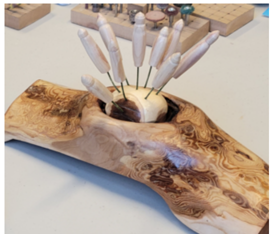
Cattails. Remie Benoit.