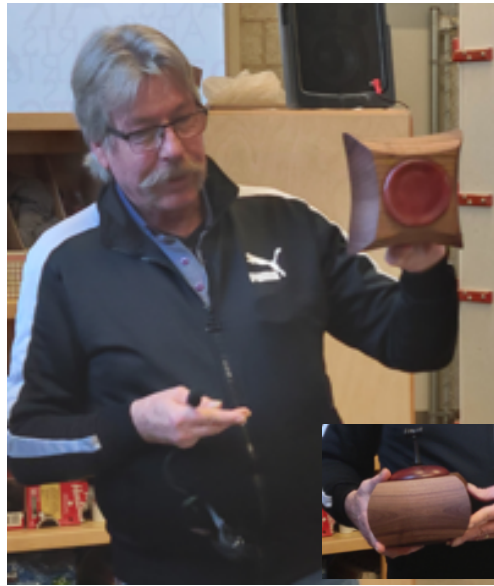
Multi-axis bowl. Walnut and bloodwood African Blackwood.